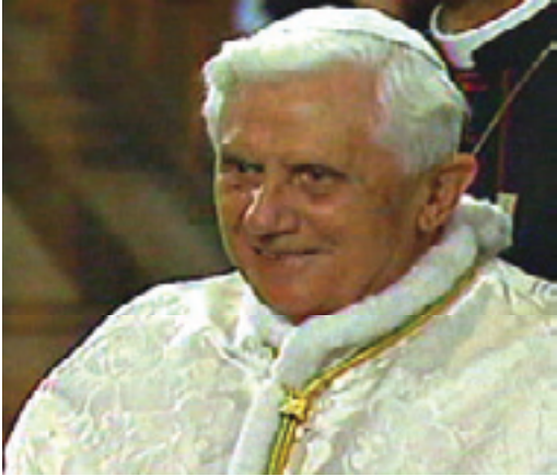
Message of His Holiness Pope Benedict XVI for LENT 2009