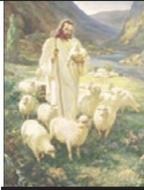
The Good Shepherd, Warner Sallman

“My Father, who has given them to Me, is greater than all, and no one can take them out of the Father’s hand.”