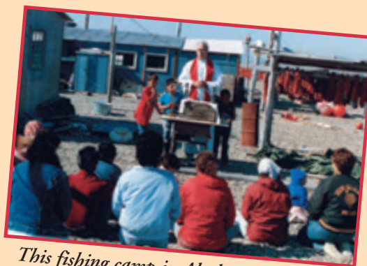
This fishing camp in Alaska is one of four small communities near the Arctic Circle that share one priest!

So next time you go to Mass and receive Communion, think about how lucky you are! Many other people wish they were as blessed as you!