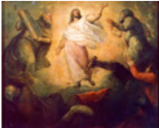
The Transfiguration, Titian