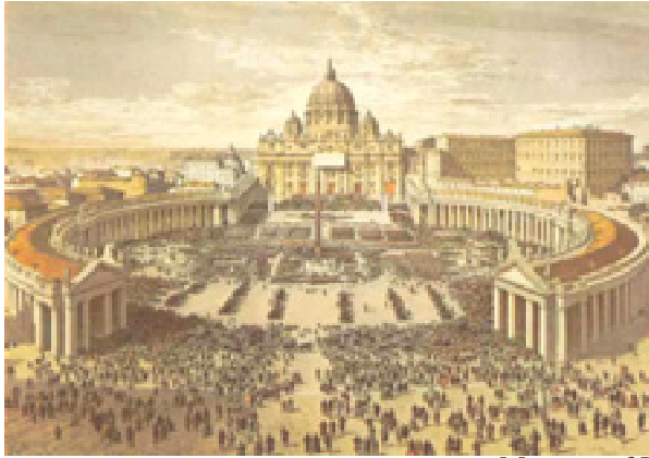
Message of His Holiness Pope Benedict XVI for LENT 2010

“The justice of God has been manifested through faith in Jesus Christ” (cf. Rm 3, 21-22)