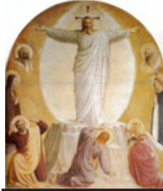
The Transfiguration, Fra Angelico