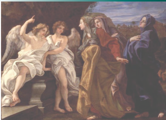
The Three Marys at the Sepulchre (Il Baciccio) c. 1684