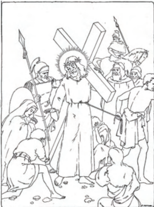
Take up your cross, and follow Me.